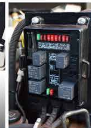
Modular high protection electrical box