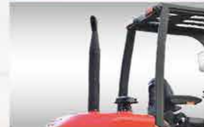
High exhaust design