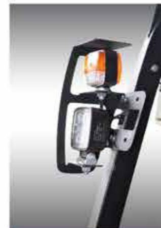
LED lamps, energy efficient, long life, no maintenance