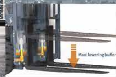
Mast with decline buffer function