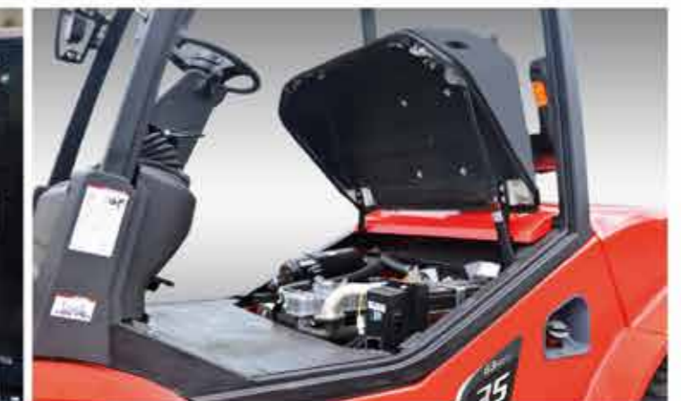
Engine cover with large opening angle, large maintenance space