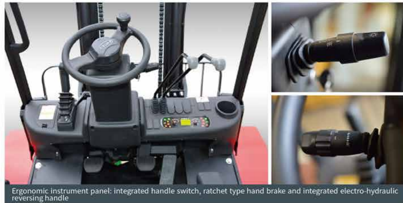
Ergonomic instrument panel: integrated handle switch, ratchet type hand brake and integrated electro-hydraulic reversing handle