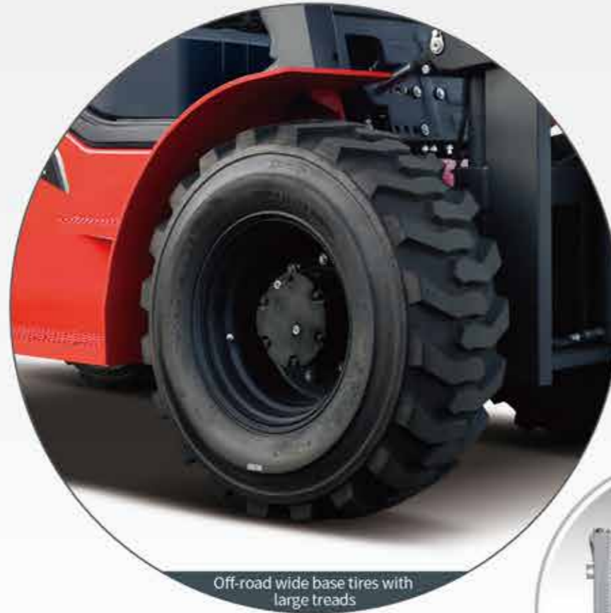
Off-road wide base tires with large treads